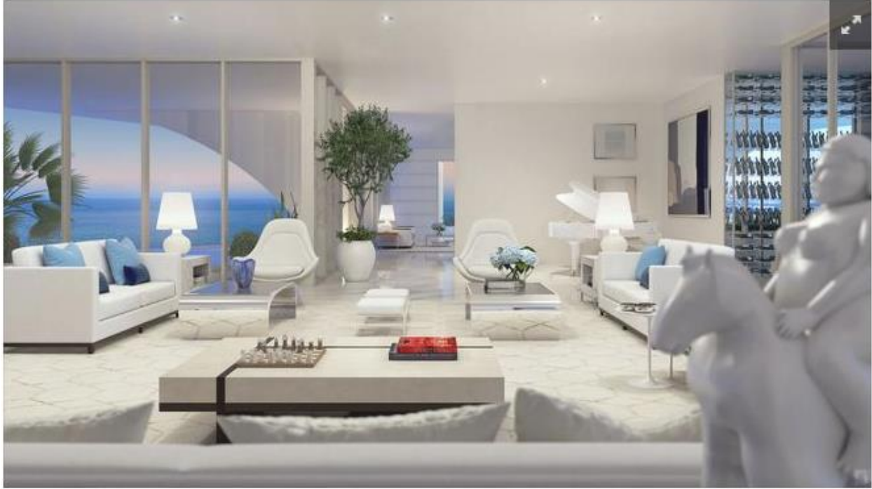
A lower penthouse at Jade Signature sold for $18.5 million.