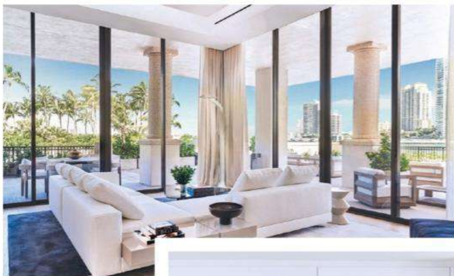
From top: Residences feature floor-to-ceiling windows with water views of the surrounding island; BOFFI kitchens contain top-of-the-line appliances.

THE CHALLENGE The construction team had to meticulously plan the project's concrete pours because the trucks had to be transported to the island over the water via barges. Everything had to align perfectly like a symphony, including the weather. The result? The equivalent of Beethoven's Fifth: perfection.