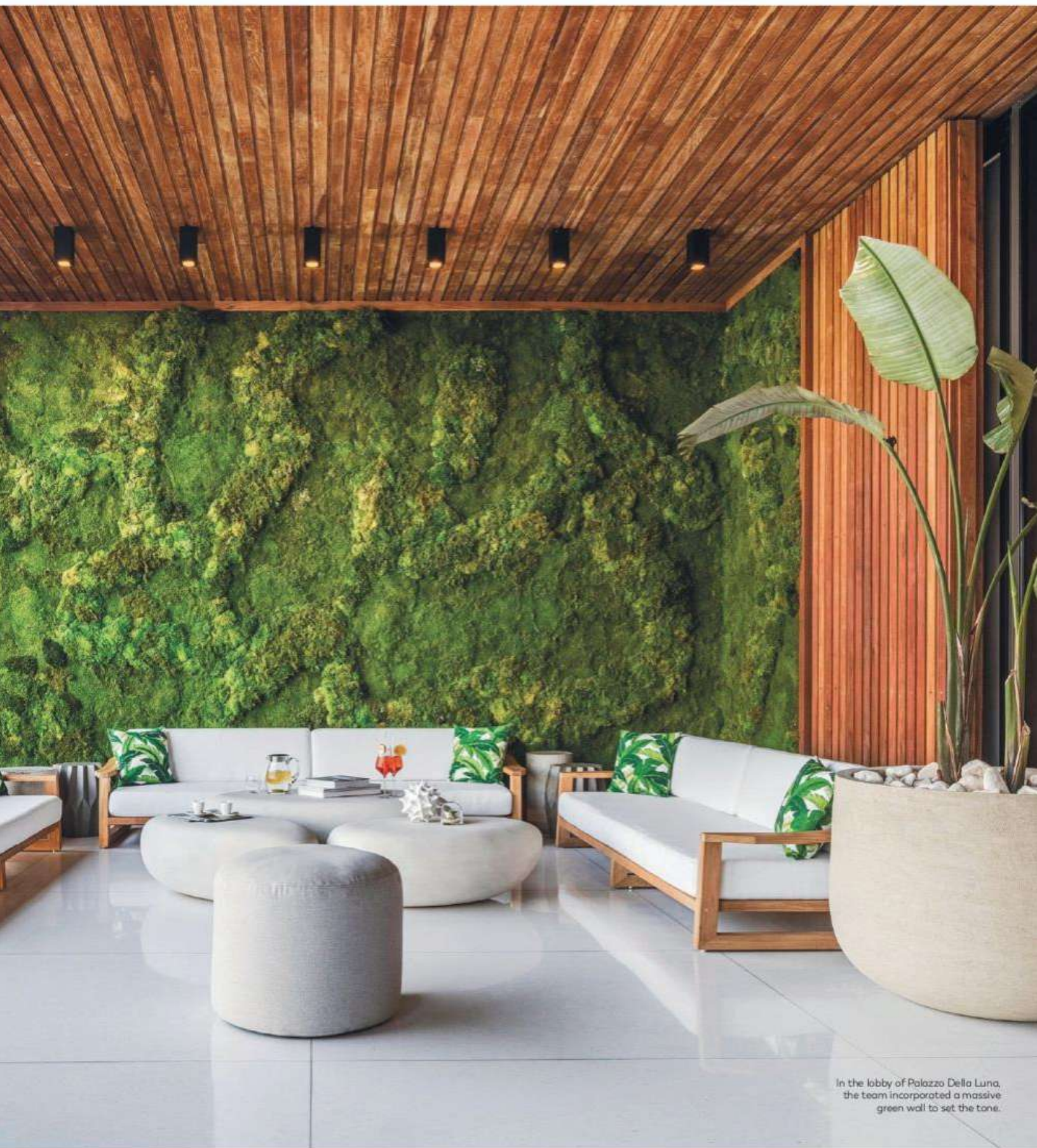
In the lobby of Palazzo Della Luna, the team incorporated a massive green wall to set the tone.