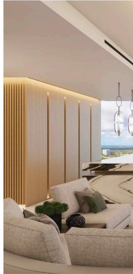
Left, from top: Hallock Design Group's contemporary living space; B+G Design reflects the outdoors in its design.