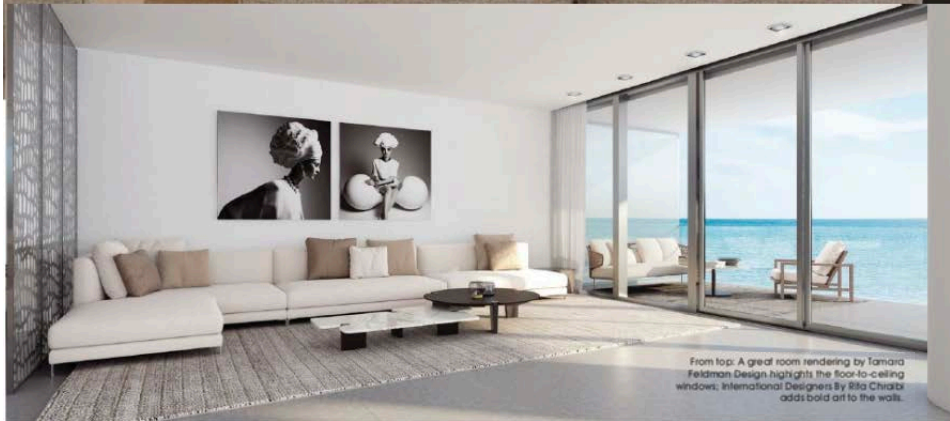
From top: A great room rendering by Tamara Feldman Design highlights the floor-to-ceiling windows. International Designers By R3A Chishti adds bold art to the walls.