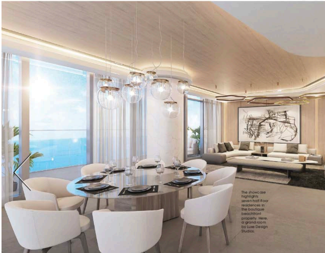
The showcase highlights seven half-floor residences in the boutique beachfront property. Here, a grand room by Luxe Design Studios.