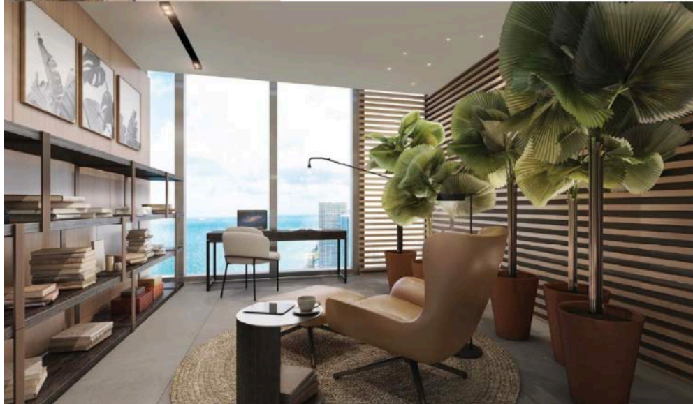
From top: A palette of grays and statement artwork in a bedroom by Pepe Calderin Design; Atelier de Yarvorsky brings natural elements into an office space.