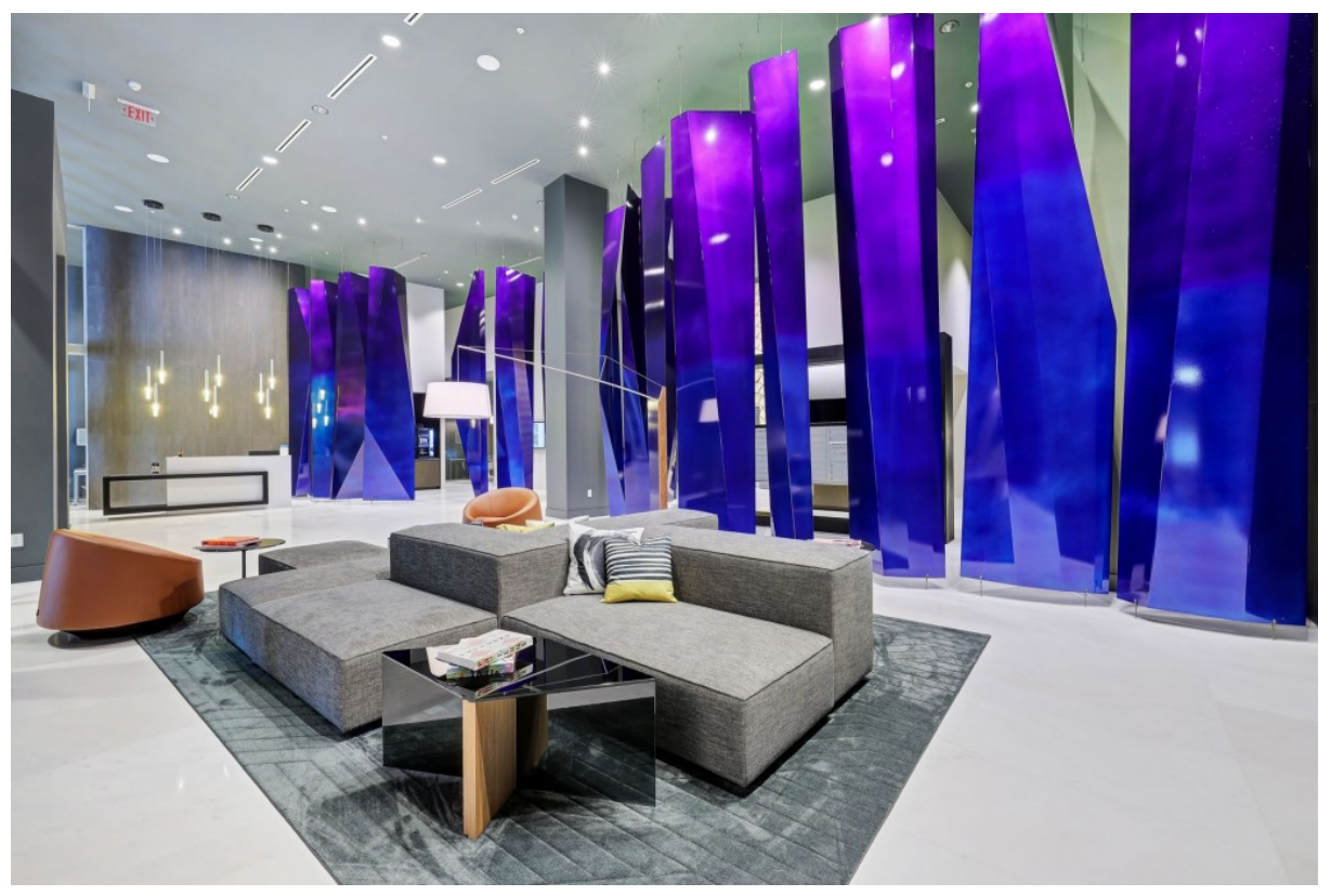
Quadro Miami - Dec 2020 4

Architecturally designed by Behar Font & Partners, the two-tower 12-story, urban resort-style condominium building offers just 198 residences that dazzle with more than 500 custom art pieces and installations of contemporary art created by ART with DNA under the direction of artist, Francisco Del Rio. The mid-rise building with two separate private lobbies, overlooking Biscayne Bay especially appeals to COVID-minded weary buyers who eschew high-rises and high touch points.