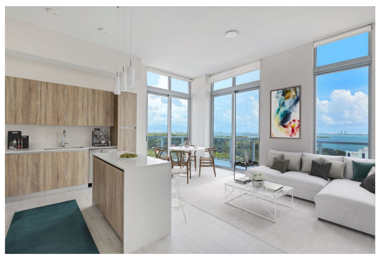
quadro miami january 2021 1

Additionally, owners have the option to purchase a unit occupied by a long-term tenant. Buyers can also choose from distinct designer-themed residences that come replete with curated furniture packages and amenities exclusively for short-term rentals, the seasonal snowbird, or vacationing guests.