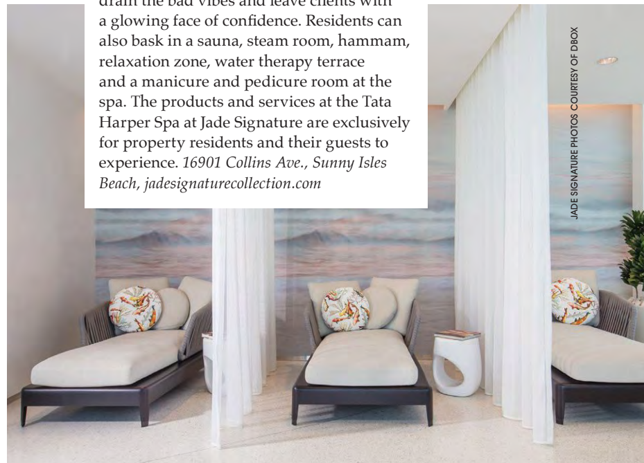
JADE SIGNATURE