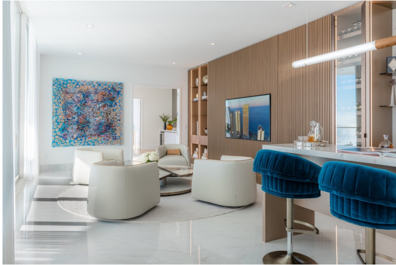
Photo: Neuelane Photo Categories: living room Bar and entertainment area