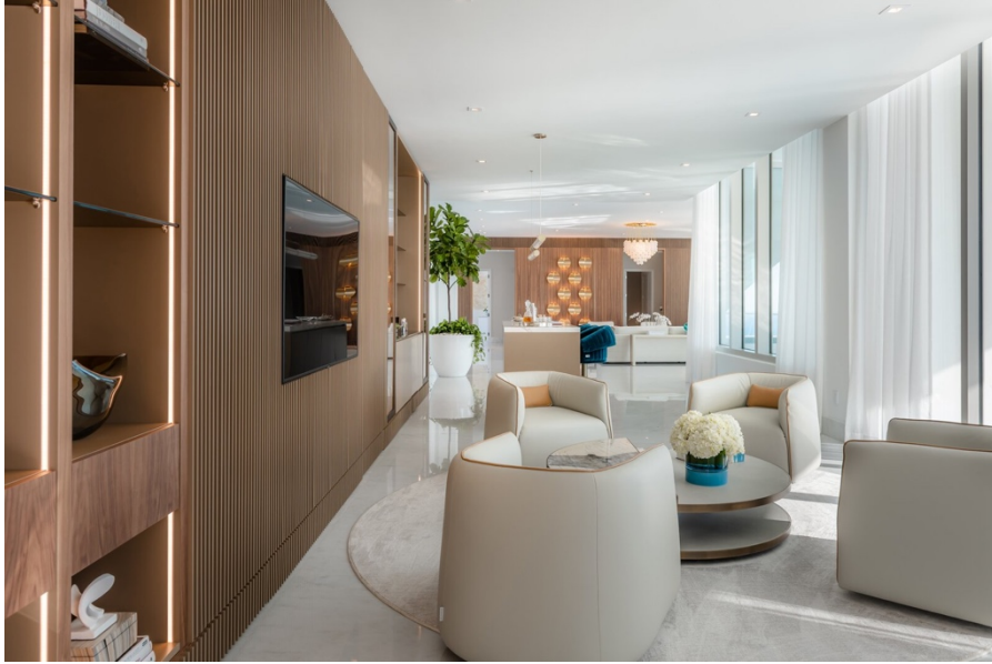
Photo Categories: living room Entertainment Bar Area