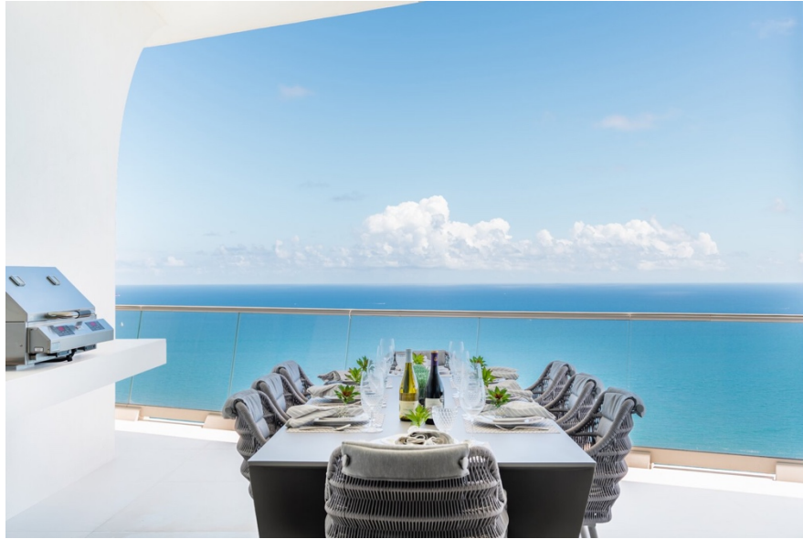
Photo: Neuelane Terrace Dining Area