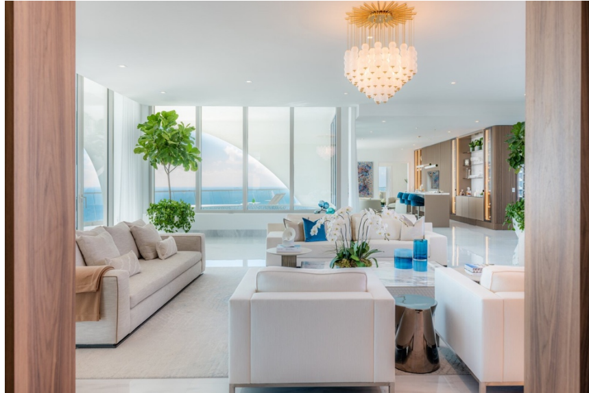
Photo: Neuelane Living Room Entrance