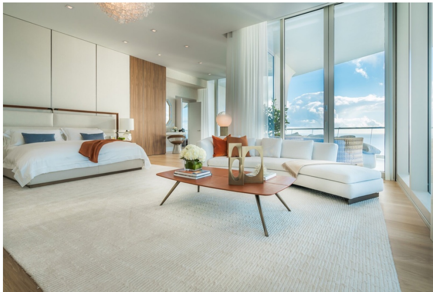
Photo: Neuelane Master Bedroom