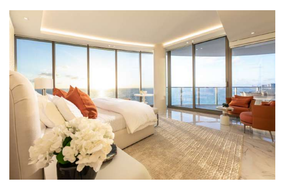
Master Bedroom & Ocean View Terrace