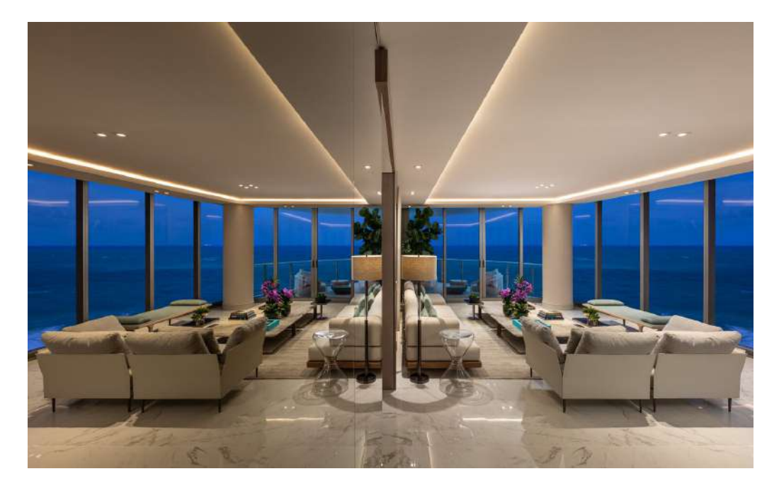
Living Area – East View