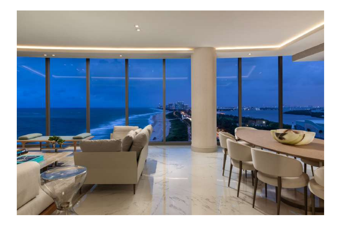
Living Area — South View