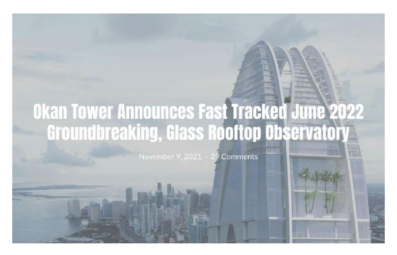
November 9, 2021

Turkish developer Okan Group has announced a fast track 2022 groundbreaking date for their tulip-shaped tower planned in downtown Miami.