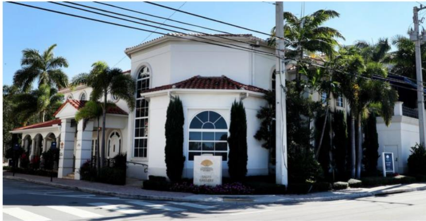
The Residences at Mandarin Oriental in Boca Raton, which has 89 units, will offer condo buyers the same hotel services received by the nearby Mandarin Oriental Hotel, which is scheduled to open this year.

“There are brand devotees who recognize the value of owning a Four Seasons home, local empty nesters who are ready to move to the beach and a large portion of buyers from the Northeast who want to take advantage of Fort Lauderdale’s amazing quality of life,” he said. “Many of our buyers have discovered Fort Lauderdale in comparison to Miami for its comparable level of finishes, services, views and amenities, but at a more enticing price point. While we have seen international buyers drawn to Fort Lauderdale’s world-renowned yachting lifestyle, the bulk of our buyer demographic is domestic.”