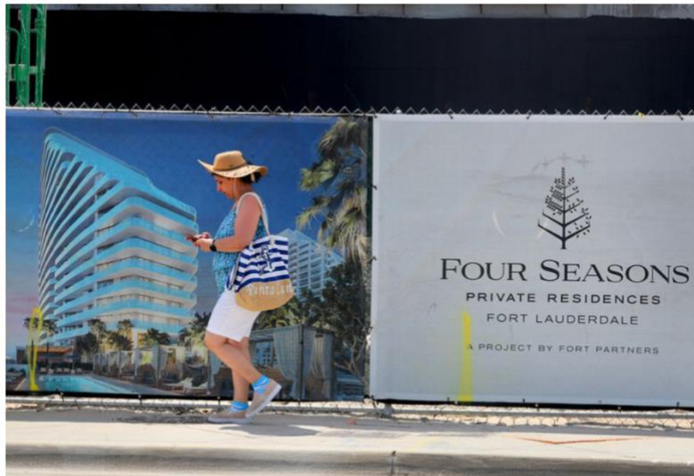
A beachgoer walks along the sidewalk in front of the Four Seasons Private Residences in Fort Lauderdale. From $15 million penthouses to million-dollar-plus homes and condos, branded luxury condos are in high demand among buyers from North America and overseas, brokers and analysts say.