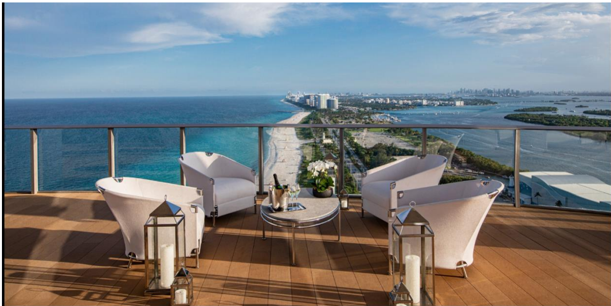
The Club Level Deck at The Ritz-Carlton Residences at Sunny Isles Beach.