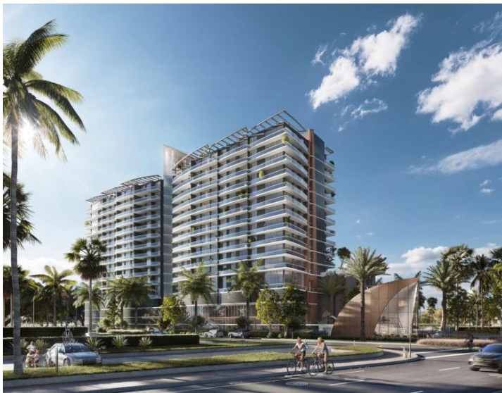
Exterior rendering of Nexo Residences Exterior. Designed by Frankel Benayoun Architects Inc. and Carlos Ott.