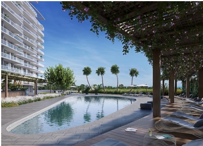
Nexo Residences' Pool Deck. Designed by Frankel Benayoun Architects Inc. and Carlos Ott.