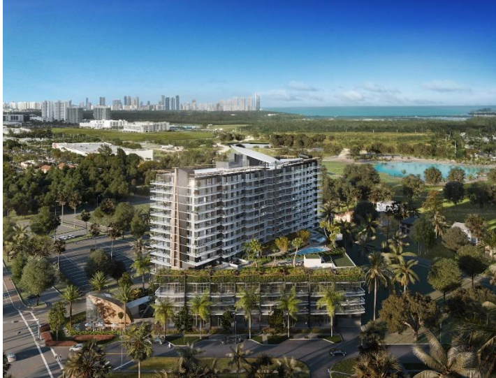
Nexo Residences. Designed by Frankel Benayoun Architects Inc. and Carlos Ott.

Nexo is the Spanish translation of the word Nexus , which can be defined as a central point that links two or more things – in this case, the ethos of the brand. The connection to all essentials is a key factor when today’s short-term renters select their next stay, reinforcing the unique opportunity for buyers to benefit from this notion within the budding submarket.